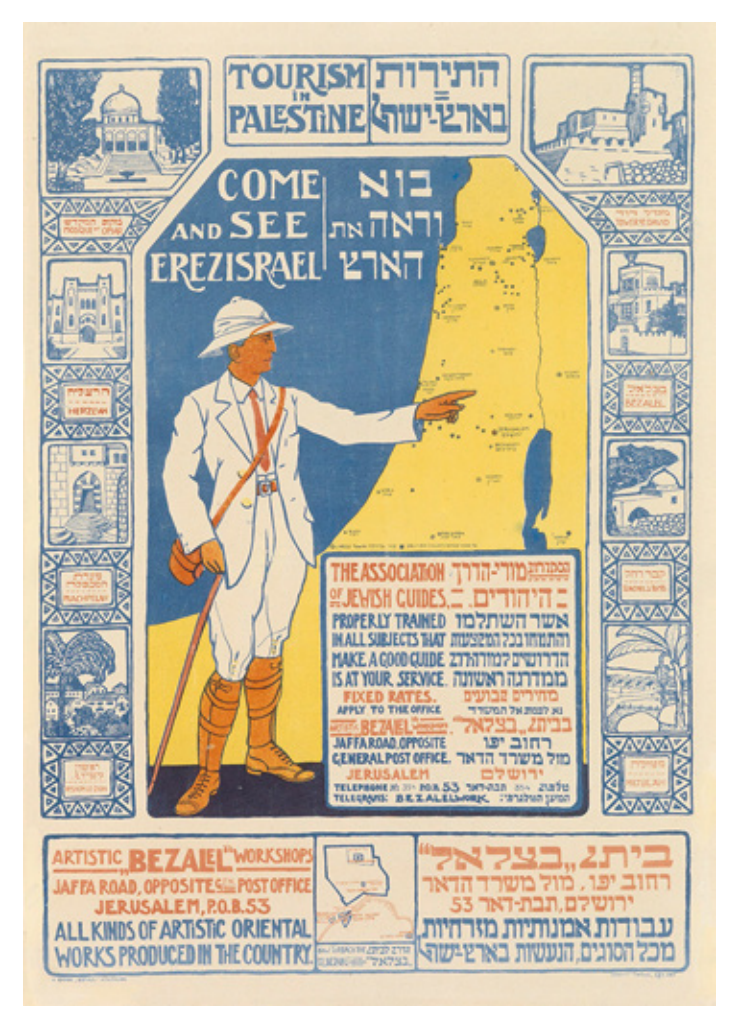
Poster published by the Bezalel Academy of Arts and Design in 1929.